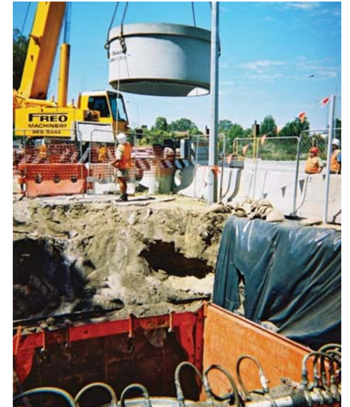
Humeceptor® installation at Booragoon Lake in Perth, Australia, to treat stormwater runoff from a catchment area near Leach Highway.

In addition to the potential storage capacity issues, the team faced tight spatial constraints. Only a 10m (33’) strip lay between Leach Highway and the nearby Booragoon Lake, thus a small footprint was an essential prerequisite for any treatment device. The solution was building an adjacent concrete stormwater oil storage tank connected to the oil storage zone of the STC18 Humeceptor®.